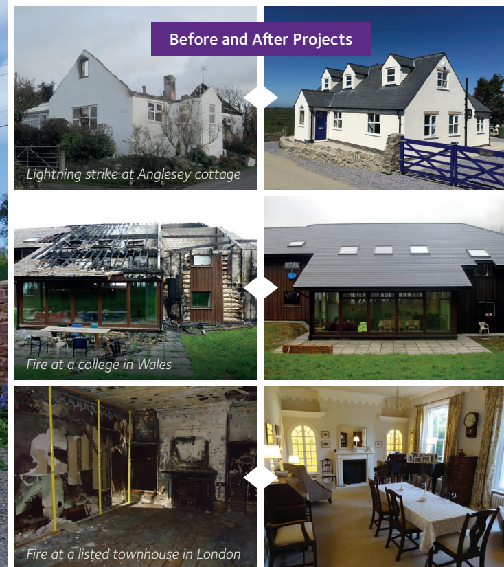
Before and After Projects