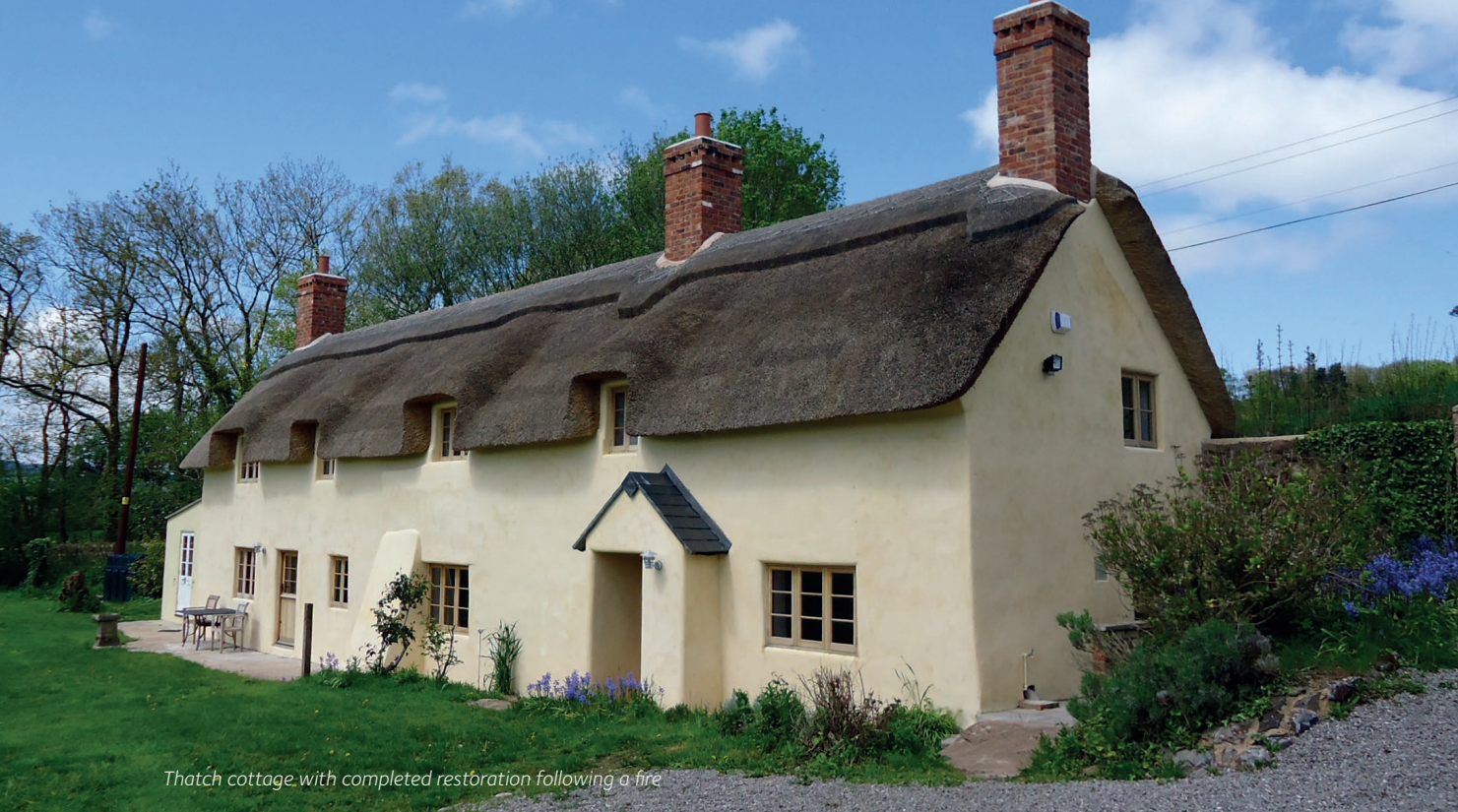
Thatch cottage with completed restoration following a fire